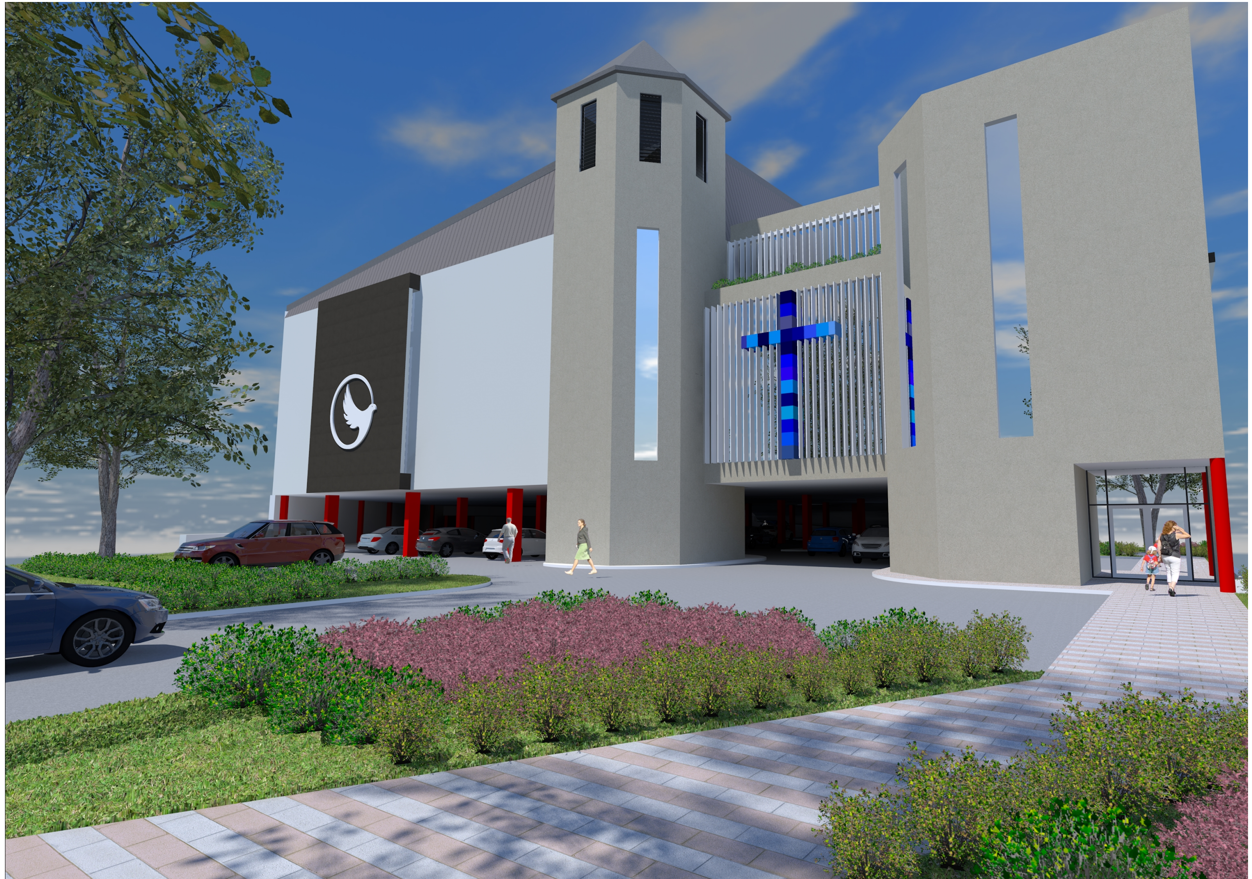
MUMFORD PLACE PERSPECTIVE

LIVING FAITH COMMUNITY CHURCH PROPOSED CHURCH - AMENDED PLANS NO.14 (LOT 7) MUMFORD PLACE, BALCATTA